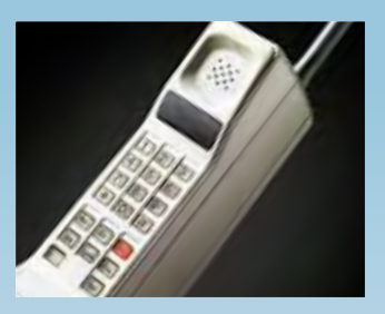
1973 'smart' phone