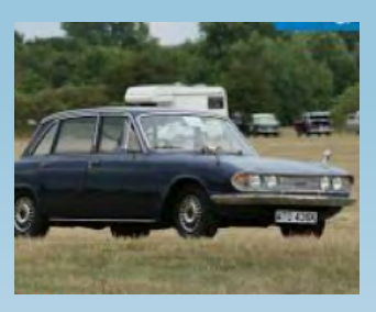
Triumph sports car – chrome bumpers!