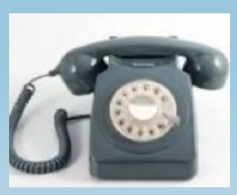
We had these in houses...