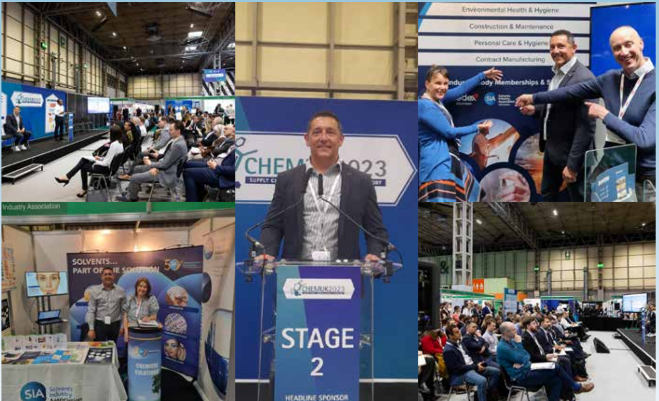
Looking forward to ChemUK 2024