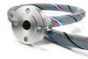
Guidance Note 60: Safe Handling of Flexible Hoses and Connections in the Solvents Industry