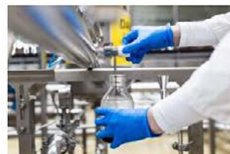
Guidance Note 64: Safe Sampling of Solvents