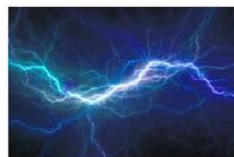
Guidance Note 47: Flammable Solvents & the Hazard of Static Electricity