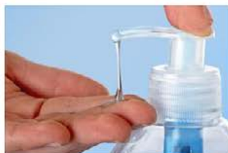
Guidance Note 65: Safe Handling and Use of Alcohol-based Sanitisers