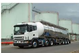
Guidance Note 27: Vapour Return on Road Tankers

Further guidance is available through our colleagues in the European Solvents Industry Group (ESIG) via the link below;