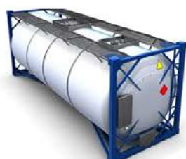
Guidance Note 43: Portable Tanks Used for Storage of Flammable Solvents