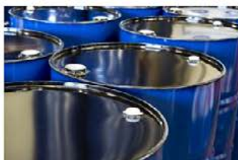
Guidance Note 56: % Fill of Packages