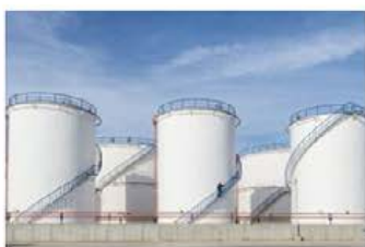
Guidance Note 52: Assessment of Customer Bulk Facilities – Revised 2020