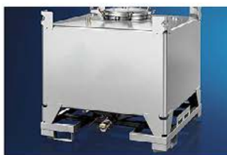
Guidance Note 51: Selection of IBCs for Handling Hydrocarbon and Oxygenated Solvents