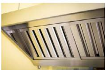
Guidance Note 63: Local Exhaust Ventilation (LEV) Procedures for Handling Solvents and Flammable Liquids