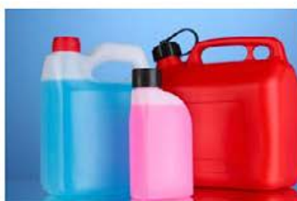
Guidance Note 61: Summary Document – Handling of Solvents in Small Packages