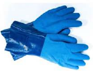
Guidance Note 62: PPE Selection for Working in Flammable Areas