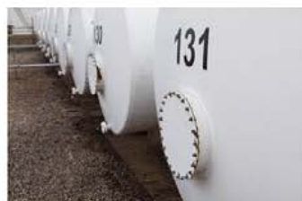
Guidance Note 57: Confined Space Entry