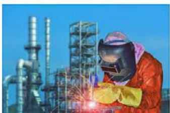
Guidance Note 58: Hot Work