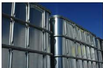
Guidance for the storage of liquids in intermediate bulk containers

Our comprehensive Guidance Notes are available free of charge, and can be downloaded here: https://www.solvents.org.uk/sia-guidance-notes/