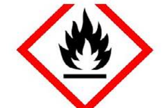
Guidance Note 55: Overview of the Classification, Labelling, & Packaging (CLP) System with respect to the Globally Harmonised System (GHS)