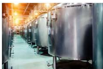
Guidance Note 53: Denatured Alcohols