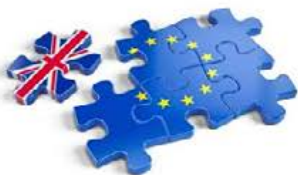
Guidance Note 66: UK REACH Summary Document 2021